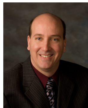
Founder, President & CEO of Skibo, Corporation

“Skibo, Corporation was founded on the principal of providing a consultative approach to a problem, excellent customer service, and reasonable pricing in proportion to the solution required.”