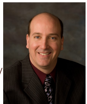
Founder, President & CEO of Skibo, Corporation

“Skibo, Corporation was founded on the principal of providing a consultative approach to a problem, excellent customer service, and reasonable pricing in proportion to the solution required.”